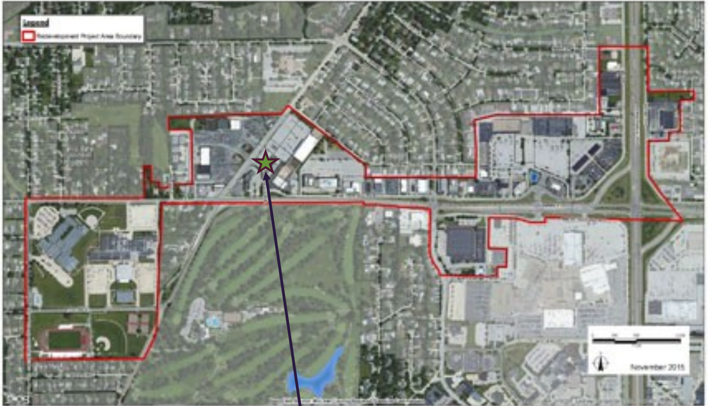
Exhibit A - Redevelopment Project Area Boundary

Empire Street Redevelopment Project Area