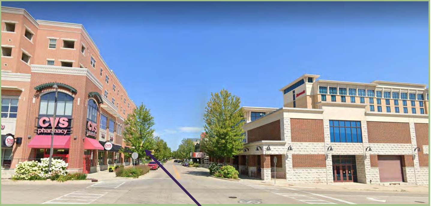
Location of Unit #106