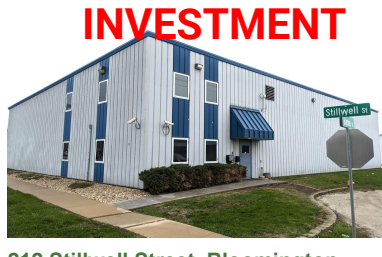
212 Stillwell Street, Bloomington

Multi-tenant building with private entry and private suite. Four room suite with private bathroom, new VCT flooring, new HVAC unit.