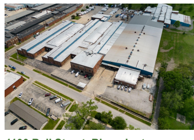
1100 Bell Street, Bloomington

Open warehouse space, 14' Overhead door, shared dock access, private restroom