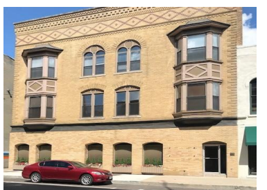
105 N. Center Street, Bloomington

Two-tenant building. 2,000 SF occupied by a church on a month to month tenancy. 1,000 SF office with OH door.