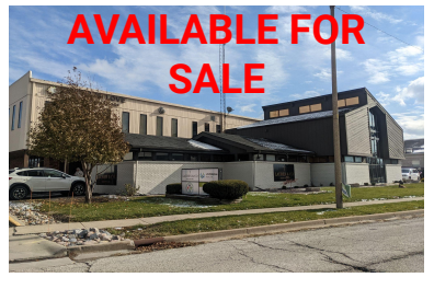
808 Eldorado Street, Bloomington

Large open work area for reception, cube space, or lounge space. The suite has six (6) private offices lining the exterior of the unit, each with a window, two private restrooms and a kitchenette with door to exterior patio.