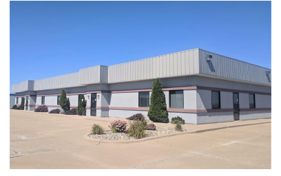
901 W. Main Street, El Paso