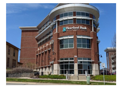
200 W. College Avenue, Normal

Flexible warehouse space with multiple buildings, dock access, overhead doors, office, private spaces, heavy power accessible.