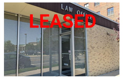
217 E. Washington, Bloomington Size: 2,180 SF + full basement Price. $2,800/month

Covered parking garage attached to building.