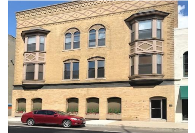
105 N. Center Street, Bloomington $499.999 Price: 6,963 SF Size:

Freestanding flex building with Loomis Armored tenancy since 1998. Extra parking lot included with purchase.