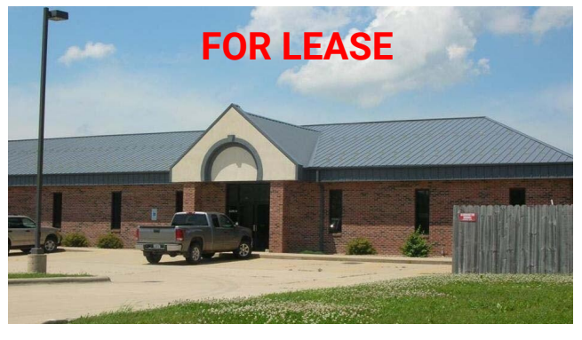
6 Heartland Drive | 2,507 SF