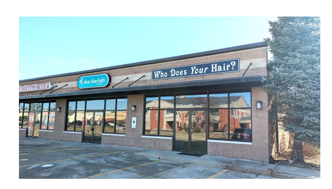
203 N. Prospect Avenue Turn-Kay Salon (Sublease)

Meghan O'Neal-Rogozinski, CCIM meghan.oneal@axis360.co 309-532-1808