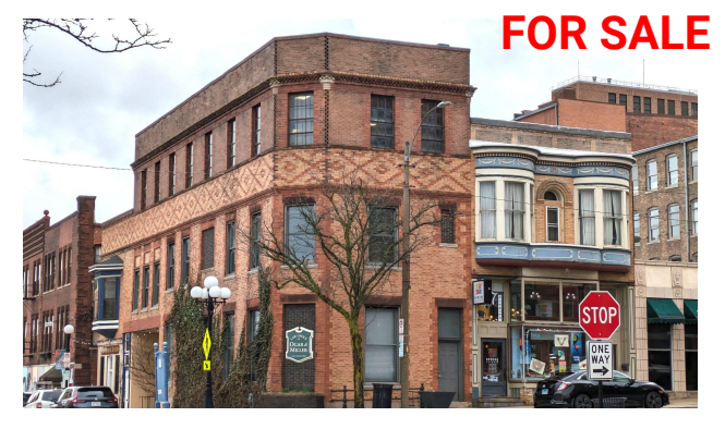
108 W. Monroe Street | 3 Stories