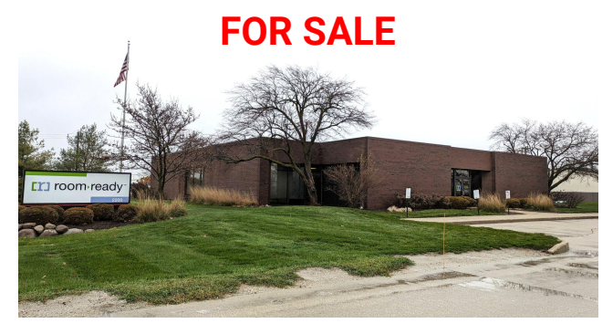
2200 N. Main Street | 9,056 SF