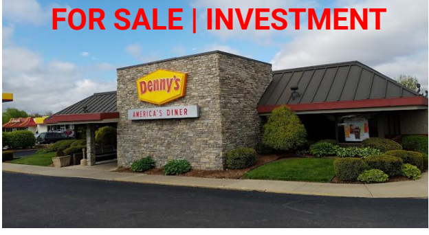
1615 N. Main Street | 8.38% cap rate