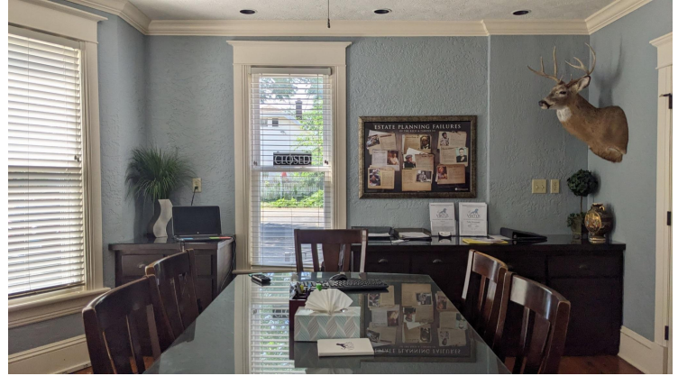
First floor conference room