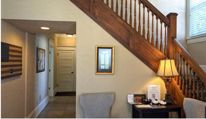
First floor entrance