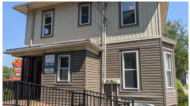
Back entrance with ramp