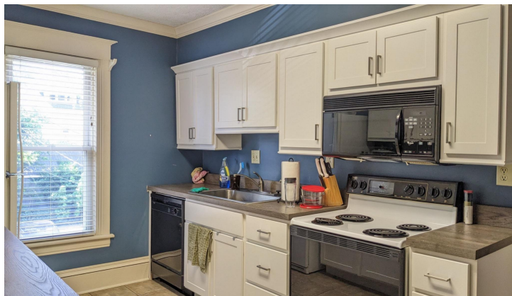
Second floor kitchen (stove, fridge, d/w)